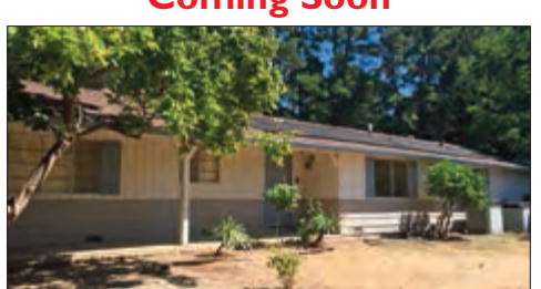
Burton Valley - call Frank 4 BR/3 BA Renovation Ready 2,200 sqft, .63 acre, pool