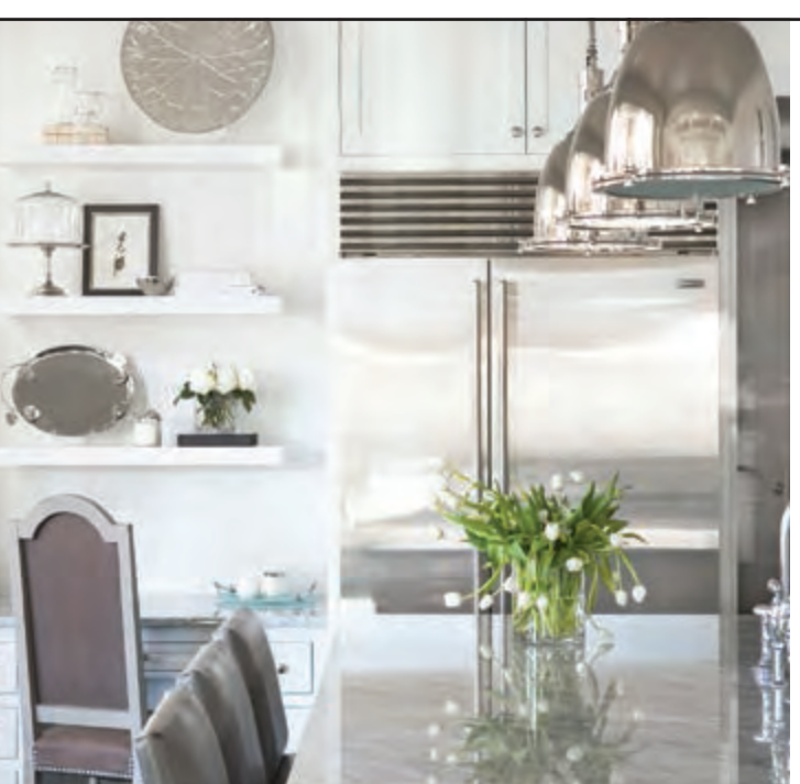
THIS IS HOME

This is where traditions and memories come to life.