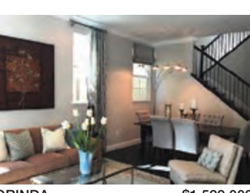
$1,599,000 ORINDA downtown Orinda. Spectacular appliances/finishes throughout CalBRE #01349169