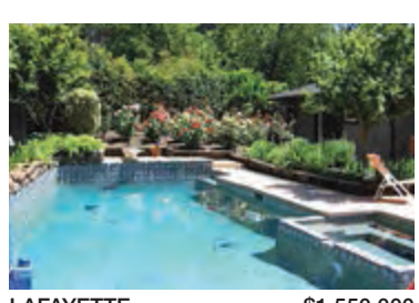
LAFAYETTE $1,550,000 4/3 Very private on over 1/2 acre. Wonderful yard with pebble-tech pool & expansive lawn. CalBRE #00587326